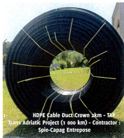
1- HDPE Cable Duct Crown 2km - TAP - Trans Adriatic Project (1 000 km) - Contractor : Spie-Capag Entrepouse