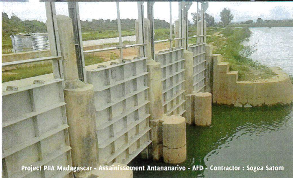
Project PIIA Madagascar - Assainissement Antananarivo - AFD - Contractor : Sogea Satom