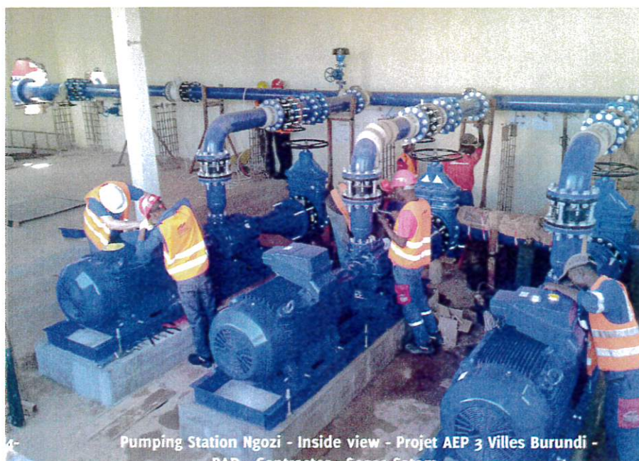
Pumping Station Ngozi - Inside view - Projet AEP 3 Villes Burundi - ADB - Contractor : Sogea Satom