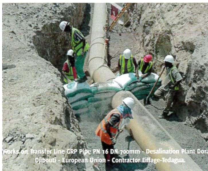
Works on Transfer Line GRP Pipe PN 16 DN 700mm - Desalination Plant Doraleh - Djibouti - European Union - Contractor Eiffage-Tedagua.