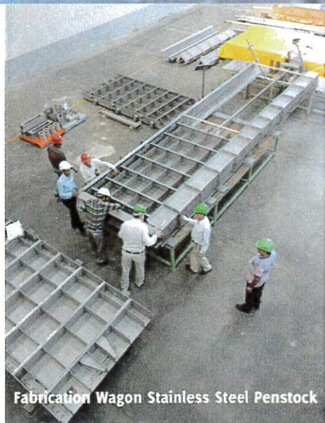
Fabrication Wagon Stainless Steel Penstock